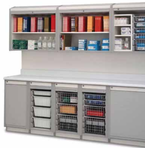
Accessories sold separately.