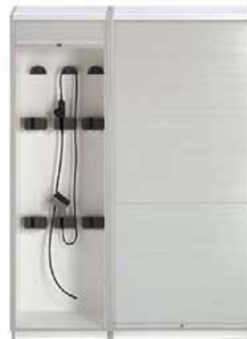
Accessories sold separately.