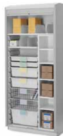
Accessories sold separately.