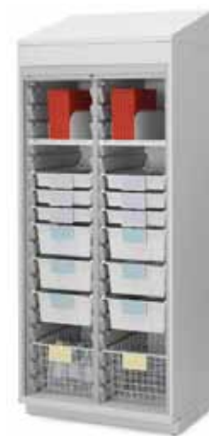
Accessories sold separately.